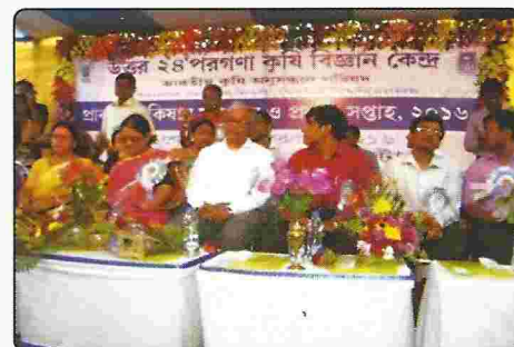
Dignitaries on the dias during Rabi Kishan Sammelan at KVK, 24 pgs (N)