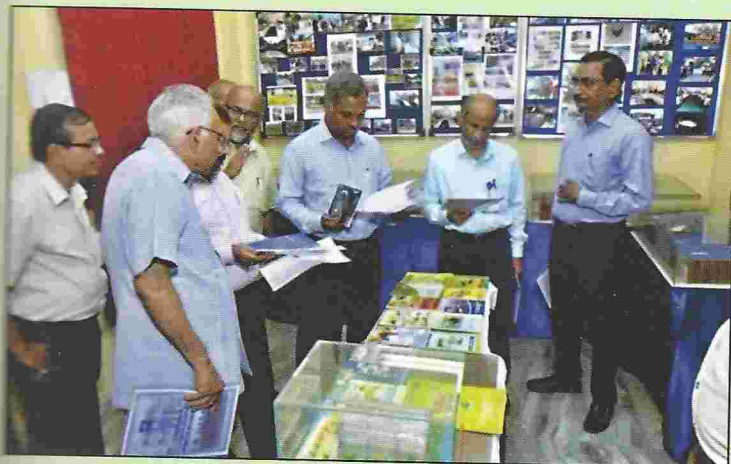
ICAR Peer Review Team visiting the photo gallery

A photo gallery comprising of photographs of different extension activities of DREF including KVKs has been established in the office of the DREF, Belgachia. The different publications made by DREF office, CDs of documentary films regarding livestock farming, books, Annual Reports of the University, News Letters, etc., and models of different farming systems are nicely displayed in the gallery which has already been praised by different visitors.