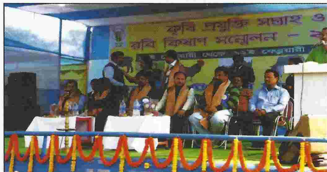
Dignitaries on the dias during Rabi Kishan Sammelan at Jalpaiguri KVK

Agricultural Technology Week And Rabi Crop Conference was organized at Jalpaiguri Krishi Vignan Kendra during 10 th – 12 th