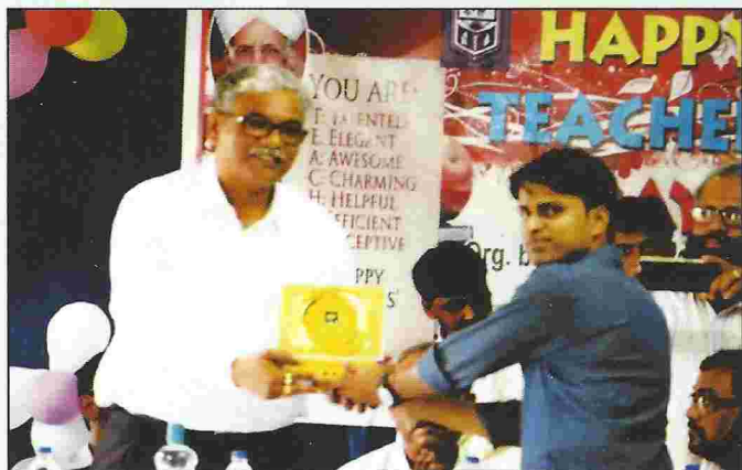
Students are felicitating Hon'ble Vice-Chancellor on Teachers' Day, 2016

Teachers' Day has been observed by the students of WBUAFS on 5 th September, 2016 at Mohanpur Campus in presence of Hon'ble Vice-Chancellor and other Faculties of the University.