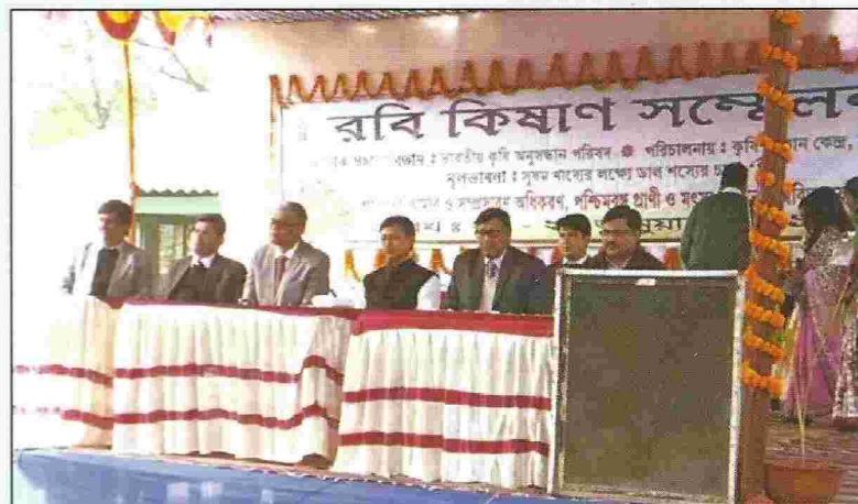
Dignitaries on the dias during Rabi Kishan Sammelan at Murshidabad KVK